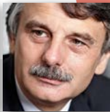
Dr. Ralf Speth Jaguar Land Rover