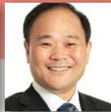
Li Shufu Geely & Volvo