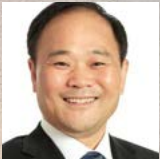
Li Shufu Chairman & Founder Geely & Volvo