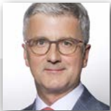
Rupert Stadler Audi